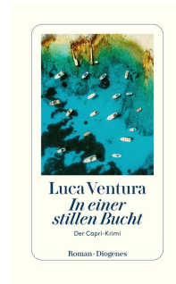
In a Hidden Cove 336 pages 2022