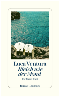
Pale as the Moon 304 pages 2023