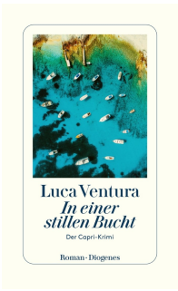
In a Hidden Cove 336 pages 2022