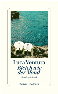
Pale as the Moon 304 pages 2023 🏆 Bestseller