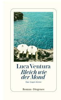
Pale as the Moon 304 pages 2023