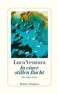
In a Hidden Cove 336 pages 2022 🏆 Bestseller