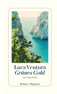
Green Gold 320 pages 2025