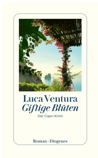
Poisonous Blossoms 368 pages 2026