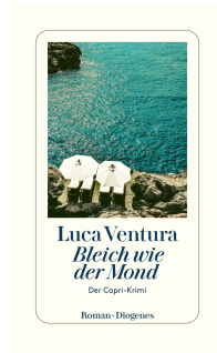
Pale as the Moon 304 pages 2023