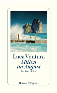
In the Middle of August 336 pages 2020 🏆 Bestseller