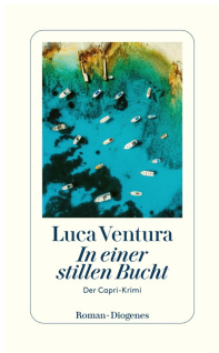
In a Hidden Cove 336 pages 2022

»A crime thriller where the blue of the sea blends with the darkest depths of human nature.« – Point de vue, Paris