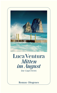
In the Middle of August 336 pages 2020