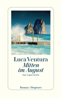
In the Middle of August 336 pages 2020