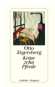
Poems 208 pages 2015