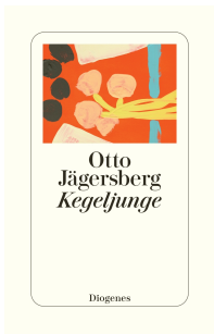
Pinboy 176 pages 2026