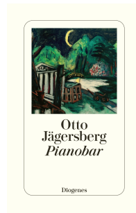
Piano Bar 272 pages 2021