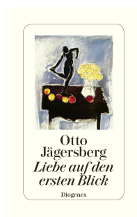
Love at First Sight 288 pages 2019