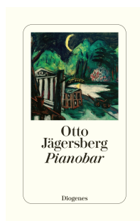
Piano Bar 272 pages 2021