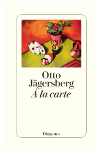
À la Carte 224 pages 2022