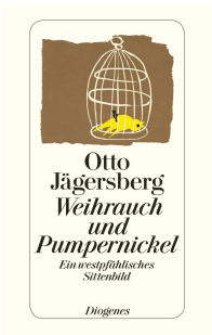
Incense and Pumpernickel 160 pages 1964