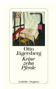
Poems 208 pages 2015