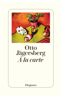
À la Carte 224 pages 2022