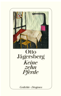
Poems 208 pages 2015