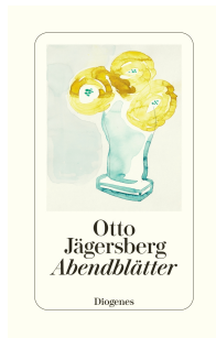
Evening Pages 176 pages 2024