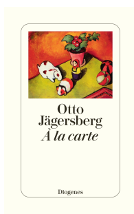
À la Carte 224 pages 2022