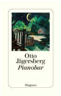
Piano Bar 272 pages 2021