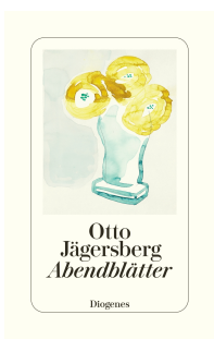
Evening Pages 176 pages 2024