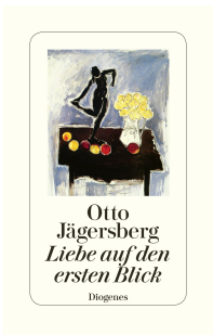
Love at First Sight 288 pages 2019