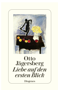
Love at First Sight 288 pages 2019