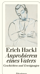
If the Father Fits 304 pages 2004