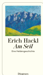
Roped Together 128 pages 2018 🏆 Bestseller