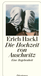
Wedding at Auschwitz 192 pages 2002 🏆 Award winner