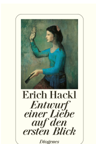
Love at First Sight 80 pages 1999