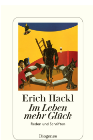
More Happiness in Life 432 pages 2019

Erich Hackl, born in Steyr, Austria in 1954, studied German and Spanish and worked as a teacher and editor for a number of years. Madrid and Vienna, where he works as a writer and translator, have been home to him for a long time now. His stories are based on authentic cases. Aurora's Motive and Farewell Sidonia are on school reading lists. Erich Hackl has received numerous awards, including the 2017 ›Human Rights Award‹ of the state of Upper Austria, the ›Anton Wildgans Prize 2015‹ by the Federation of Austrian Industry and the ›Award for Literature‹ from the city of Vienna in 2002.