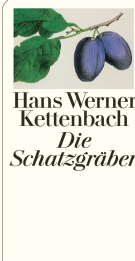
The Treasure-Hunters 544 pages 1998