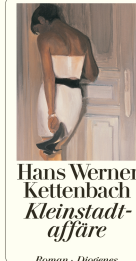
Small Town Affairs 512 pages 2004