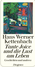
Aunt Joice and the Joy of Life 432 pages 2010