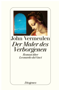
The Painter of the Shadows 592 pages 2011