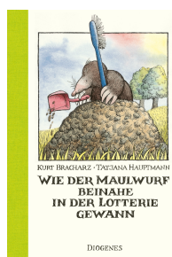
How the Mole Nearly Won the Lottery 64 pages 1981