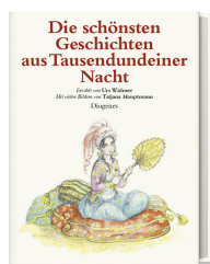
The Most Beautiful Tales From the Arabian Nights 144 pages 2008