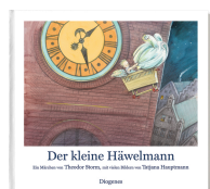
Little John 40 pages 2011