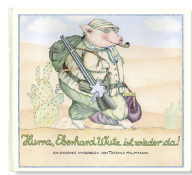
Hurray for Peregrine Pig 32 pages 1979