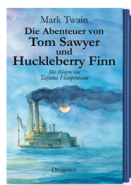
The Adventures of Tom Sawyer and Huckleberry Finn 816 pages 2002