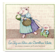
A Day in the Life of Petronella Pig 32 pages 1978