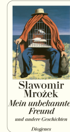
My Unknown Friend 192 pages 1999