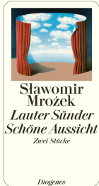
All Sinners and A Lovely View 208 pages 2002