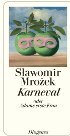
Carnival or The First Wife of Adam 80 pages 2014