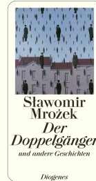
The Doppelgänger 272 pages 2000