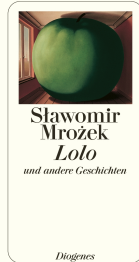
Lolo 304 pages 2000