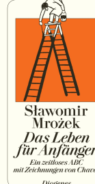
Life for Beginners 192 pages 2004