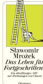
Life for the Advanced 240 pages 2006