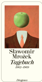
Journal 1962 - 1969 544 pages 2014

›Brilliant [...] the writer is an Aesop for our times.« – Publishers' Weekly, New York