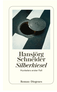
Silver Pebbles 240 pages 2011 📺 Movie Adaptation 🏆 Bestseller