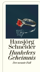
Hunkeler's Secret 208 pages 2015