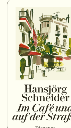
In the Café and on the Street 240 pages 2019