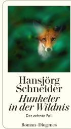
Hunkeler in the Wilderness 224 pages 2020 Bestseller