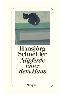
Hippos under the House 224 pages 2012