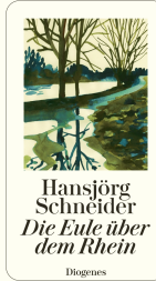
The Owl over the Rhine 288 pages 2021 Bestseller