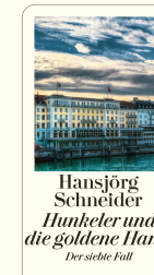
Hunkeler and the »Golden Hand« 240 pages 2013