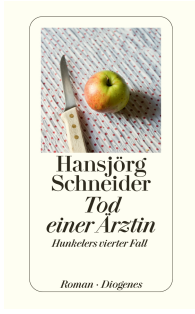
Death of a Doctor 240 pages 2011 📺 Movie Adaptation 🏆 Bestseller