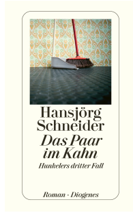
The Couple on the Barge 224 pages 2011 📺 Movie Adaptation 🏆 Bestseller