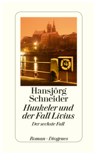
The Murder of Anton Livius 256 pages 2013 📺 Movie Adaptation 🏆 Bestseller