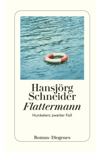
The Fluttering Man 160 pages 2011 🏆 Bestseller