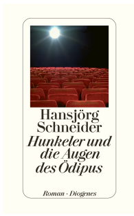
Hankeler and the Eyes of Oedipus 240 pages 2010 📺 Movie Adaptation 🏆 Bestseller