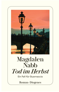
Death in Autumn 224 pages 1990