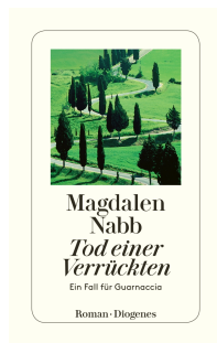
The Marshal and the Madwoman 320 pages 1997