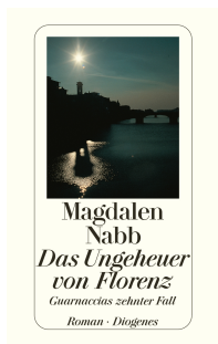
The Monster of Florence 544 pages 1997