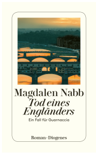
Death of an Englishman 224 pages 1991