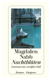
Some Bitter Taste 336 pages 2002