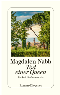
The Marhsal's Own Case 240 pages 1994