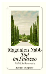
The Marshal Makes His Report 288 pages 1995