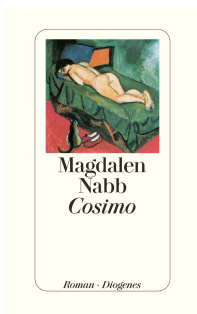
Cosimo 304 pages 2004