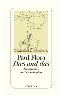
This and That 144 pages 1997