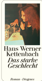
The Stronger Sex 448 pages 2009