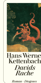
David's Revenge 304 pages 1994