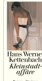
Small Town Affairs 512 pages 2004