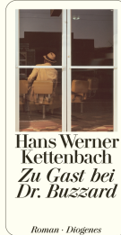
A Visit to Dr. Buzzard 368 pages 2006