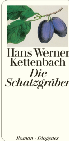
The Treasure-Hunters 544 pages 1998