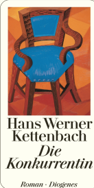
The Rival 528 pages 2002