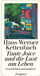
Aunt Joice and the Joy of Life 432 pages 2010