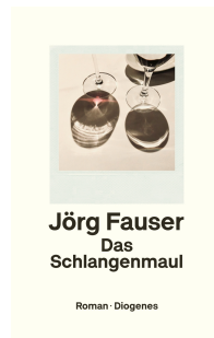
Jörg Fauser Das Schlangenmaul Roman · Diogenes