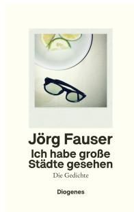
Jörg Fauser Ich habe große Städte gesehen Die Gedichte Diogenes

Everything Must Be Completely Different 288 pages 2020