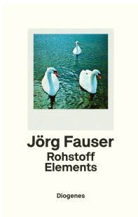
Jörg Fauser Rohstoff Elements Diogenes