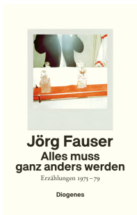
Jörg Fauser Alles muss ganz anders werden Erzählungen 1975–79 Diogenes

Everything Must Be Completely Different 288 pages 2020