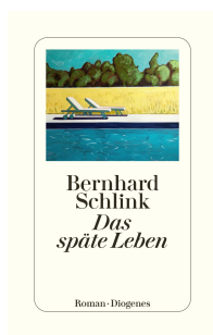
The Late Life 240 pages 2024 🏆 Bestseller