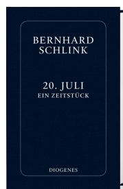
The 20th of July 96 pages 2021