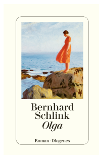
Olga 320 pages 2018 🏆 Bestseller