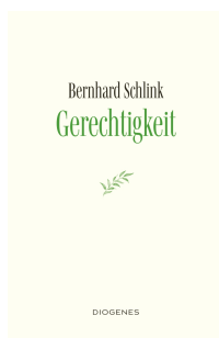
Justice 208 pages 2026

Bernhard Schlink, born in 1944, was a Professor of Public Law and Legal Philosophy and a former judge at the Constitutional Court of North Rhine-Westphalia. His first novel, Self's Justice , was published in 1987; his 1995 novel The Reader , translated into more than fifty languages and adapted by Stephen Daldry into a film starring Kate Winslet, established his worldwide renown. He has been awarded with national and international prizes like the German ›Bundesverdienstkreuz (Order of Merit) 1st Class‹, the French ›Chevalier dans l'Ordre de la Legion d'Honneur‹ and the Italian ›Grinzane Cavour Prize‹. His latest novel is The Late Life .