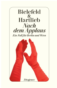
After the Curtain Falls 400 pages 2013