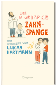
The Magic Braces 240 pages 2018