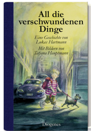
All the Missing Things 96 pages 2011