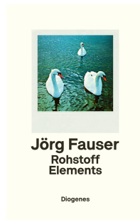
Jörg Fauser Rohstoff Elements Diogenes