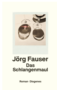
Jörg Fauser Das Schlangenmaul Roman Diogenes