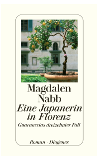
The Innocent 352 pages 2006