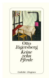
Poems 208 pages 2015