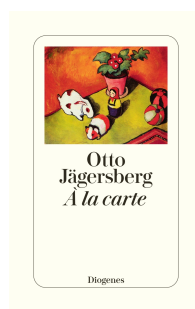
À la Carte 224 pages 2022