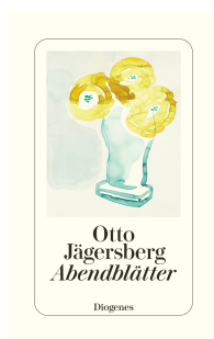
Evening Pages 176 pages 2024