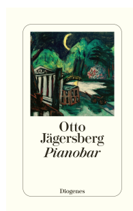
Piano Bar 272 pages 2021