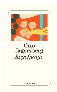
Pinboy 176 pages 2026