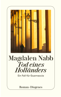
Death of a Dutchman 288 pages 1992