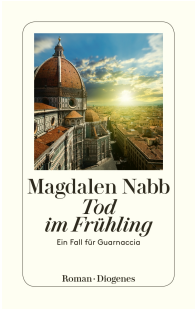
Death in Springtime 224 pages 1988