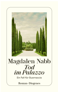
The Marshal Makes His Report 288 pages 1995