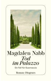
The Marshal Makes His Report 288 pages 1995