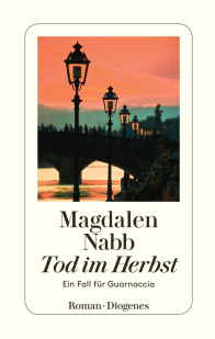
Death in Autumn 224 pages 1990