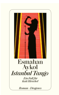
Istanbul Tango 336 pages 2016