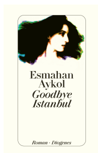
Goodbye Istanbul 368 pages 2007