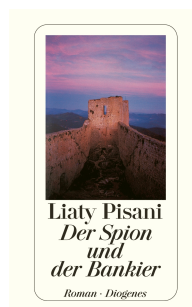
The Spy and the Banker 448 pages 1999