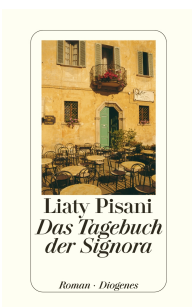
The Signora's Diary 288 pages 2007