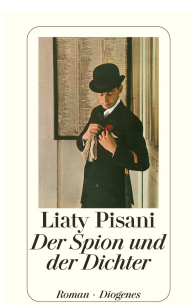
The Spy And the Poet 416 pages 1997