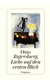
Love at First Sight 288 pages 2019