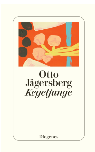
Pinboy 176 pages 2026