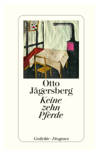
Poems 208 pages 2015