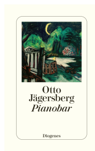
Piano Bar 272 pages 2021