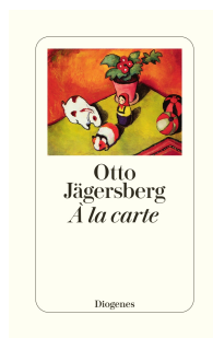
À la Carte 224 pages 2022