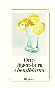
Evening Pages 176 pages 2024