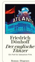
The English Dancer 304 pages 2010