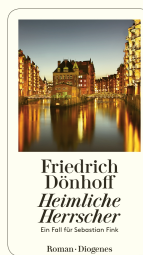
Secret Rulers 352 pages 2017