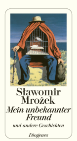
My Unknown Friend 192 pages 1999