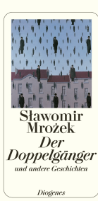
The Doppelgänger 272 pages 2000