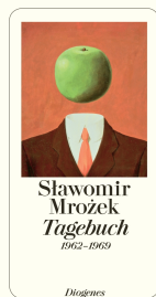
Journal 1962 - 1969 544 pages 2014

»Brilliant [...] the writer is an Aesop for our times.« – Publishers' Weekly, New York