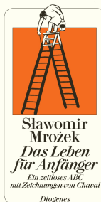
Life for Beginners 192 pages 2004