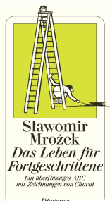
Life for the Advanced 240 pages 2006