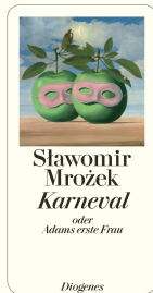
Carnival or The First Wife of Adam 80 pages 2014