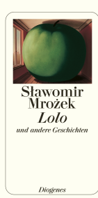
Lolo 304 pages 2000