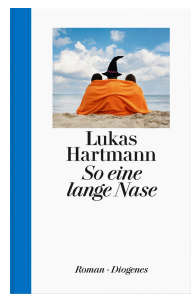
Such a Long Nose 208 pages 2010 🏆 Award winner