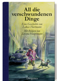
All the Missing Things 96 pages 2011