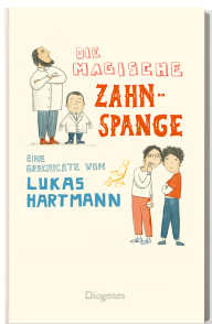
The Magic Braces 240 pages 2018