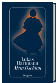
My Djinn 208 pages 2014 🏆 Award winner 📈 Bestseller