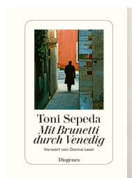
Brunetti's Venice 368 pages 2008