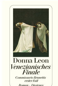
Death at La Fenice 352 pages 1993