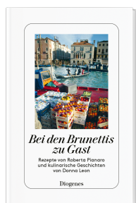
At Table with the Brunettis 288 pages 2009