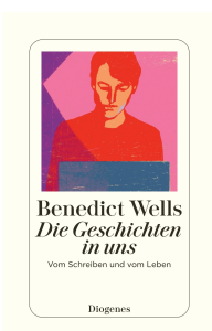
The Stories Inside Us 400 pages 2024

Benedict Wells, born in Munich in 1984, moved to Berlin after completing school and focused on his writing, earning a living with various jobs. His fourth novel, The End of Loneliness , spent more than a year and a half on the Spiegel Bestseller list, was awarded the 2016 ›European Union Prize for Literature‹, among other awards, and has been published in 39 languages. His latest novel Hard Land was awarded the independent young adult jury's ›German Youth Literature Award‹ in 2022. After several years in Barcelona, Benedict Wells now lives in Zurich.