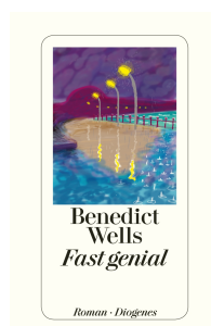
Almost Ingenious 336 pages 2011