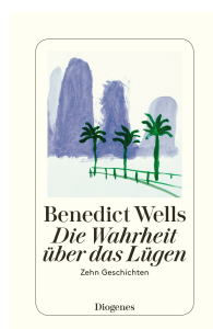
The Truth About Lying 256 pages 2018