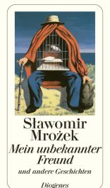
My Unknown Friend 192 pages 1999