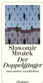
The Doppelgänger 272 pages 2000