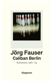
Jörg Fauser Caliban Berlin Kolumnen 1980–84 Diogenes