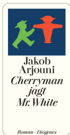
Cherryman Hunts Mister White 176 pages 2011