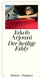
Holy Eddy 256 pages 2009