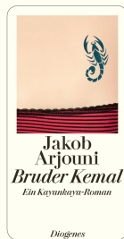
Brother Kemal 240 pages 2012