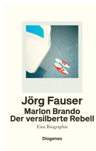
Marlon Brando 288 pages 2020