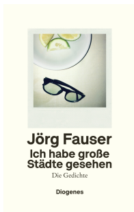
Jörg Fauser Ich habe große Städte gesehen Die Gedichte Diogenes