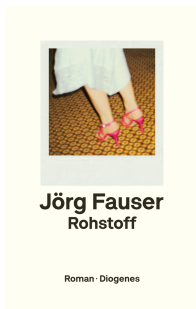
Jörg Fauser Rohstoff Roman · Diogenes