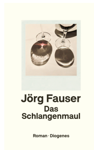
Jörg Fauser Das Schlangenmaul Roman Diogenes