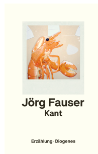
Kant 128 pages 2021