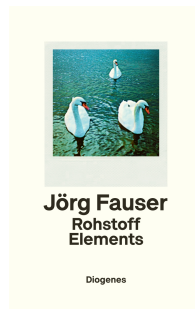
Jörg Fauser Rohstoff Elements Diogenes