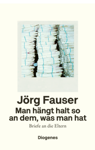
You Just Cling On to What You've Got 464 pages 2023

Jörg Fauser (1944 – 1987) was born near Frankfurt. After dropping out of university, he spent some years living in Istanbul and London, making a living in office jobs, as an airport worker and night watchman, among other things. In 1974, he switched to writing. His novels, poems, newspaper articles and short stories occupy an exceptional position in German literature. Jörg Fauser died in an accident on a motorway near Munich on the night after his birthday. »At first, I didn't want to become a professional writer, I just wanted to write. I imagined a normal existence while producing a few eternal things on the side.« Jörg Fauser