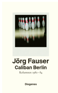
Jörg Fauser Caliban Berlin Kolumnen 1980-84 Diogenes