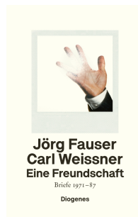
A Friendship 368 pages 2021