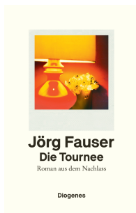
The Tour 288 pages 2022