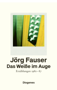
The White of the Eye 464 pages 2021