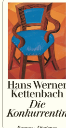
The Rival 528 pages 2002