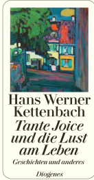
Aunt Joice and the Joy of Life 432 pages 2010