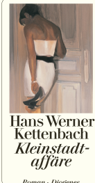
Small Town Affairs 512 pages 2004