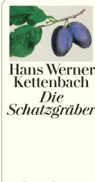
The Treasure-Hunters 544 pages 1998