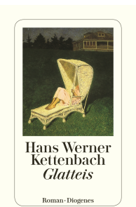
Black Ice 272 pages 2001