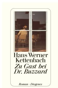
A Visit to Dr. Buzzard 368 pages 2006