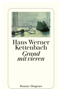
Grand With Four 240 pages 2000