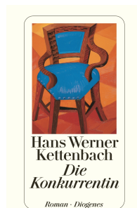
The Rival 528 pages 2002