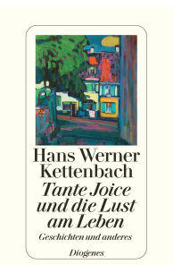
Aunt Joice and the Joy of Life 432 pages 2010