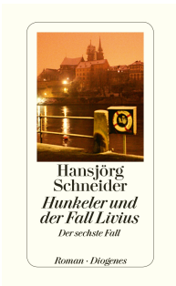
The Murder of Anton Livius 256 pages 2013