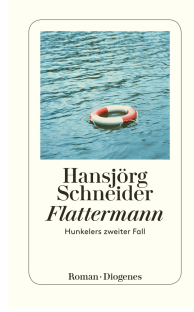
The Fluttering Man 160 pages 2011