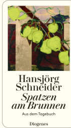
Sparrows at the Fountain 208 pages 2023 Bestseller