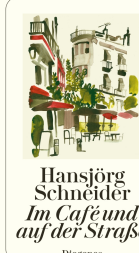
In the Café and on the Street 240 pages 2019