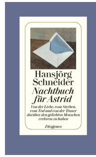
Night Book for Astrid 128 pages 2012