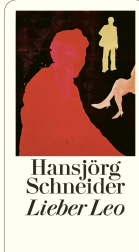
Dear Leo 304 pages 2016