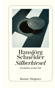
Silver Pebbles 240 pages 2011