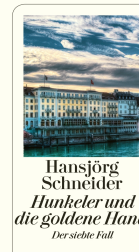
Hunkeler and the »Golden Hand« 240 pages 2013