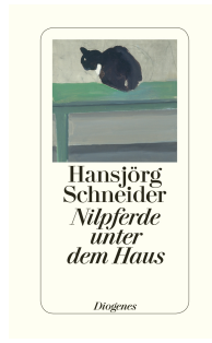
Hippos under the House 224 pages 2012