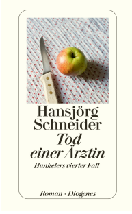
Death of a Doctor 240 pages 2011