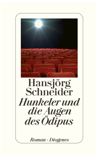
Hankeler and the Eyes of Oedipus 240 pages 2010