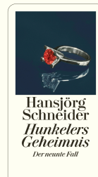
Hunkeler's Secret 208 pages 2015