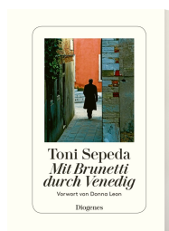
Brunetti's Venice 368 pages 2008