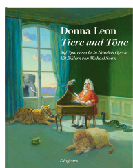
Handel's Bestiary 144 pages 2010

Donna Leon, born in New Jersey in 1942, has worked as a travel guide in Rome and as a copywriter in London. She taught literature in universities in Iran, China, and Saudi Arabia. The Brunetti novels brought her to world-wide fame. Donna Leon lived in Italy for many years, and although she now lives in Switzerland, she often visits Venice.