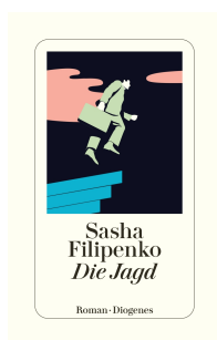
The Hunt 288 pages 2022 Award winner Bestseller