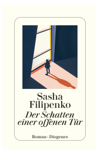
The Shadow of an Open Door 272 pages 2024 Award winner