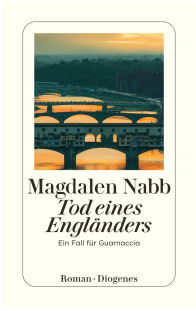
Death of an Englishman 224 pages 1991