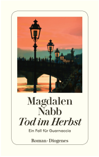
Death in Autumn 224 pages 1990