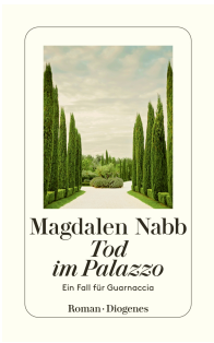
The Marshal Makes His Report 288 pages 1995