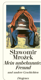
My Unknown Friend 192 pages 1999