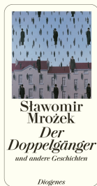
The Doppelgänger 272 pages 2000