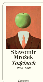
Journal 1962 - 1969 544 pages 2014

»Brilliant [...] the writer is an Aesop for our times.« – Publishers' Weekly, New York