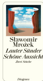
All Sinners and A Lovely View 208 pages 2002