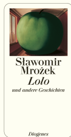
Lolo 304 pages 2000