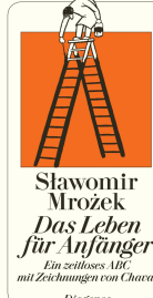
Life for Beginners 192 pages 2004