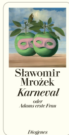
Carnival or The First Wife of Adam 80 pages 2014