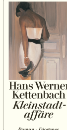
Small Town Affairs 512 pages 2004