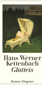
Black Ice 272 pages 2001