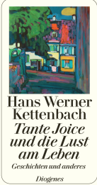
Aunt Joice and the Joy of Life 432 pages 2010

Hans Werner Kettenbach (1928 - 2018) studied many things over the years in four universities; he has worked as an advertising salesman, a shorthand secretary for the football magazine ›Kicker‹, a radio editor and finally as the editor of a newspaper. He wrote his first novel at the age of fifty. He has written a total of fourteen, five of which have been filmed. Critics have compared them to the works of Sjöwall/Wahlöö (›Plärrer‹), Simenon and Patricia Highsmith (›FAZ‹). In 2009 Kettenbach was awarded the ›Ehrengläuser‹ prize for crime writing for his life's work.