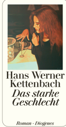
The Stronger Sex 448 pages 2009