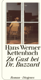
A Visit to Dr. Buzzard 368 pages 2006