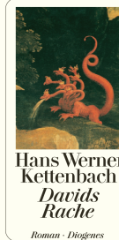
David's Revenge 304 pages 1994