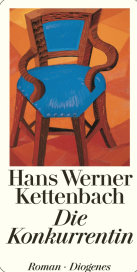
The Rival 528 pages 2002