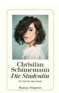
The Student 272 pages 2009