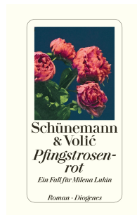
Peony Red 368 pages 2016