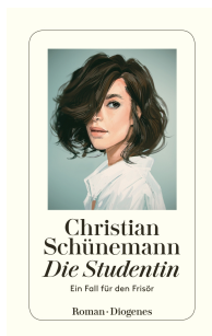
The Student 272 pages 2009