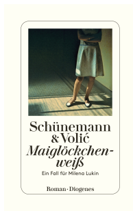
Lily-of-the-Valley White 352 pages 2017