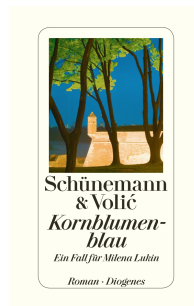
Cornflower Blue 368 pages 2013