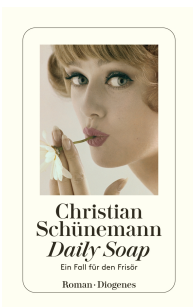
Daily Soap 240 pages 2011