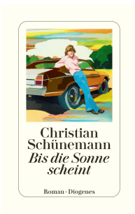
Until the Sun Shines 256 pages 2025