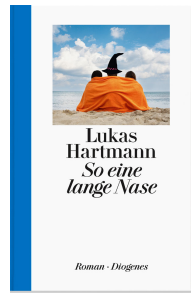
Such a Long Nose 208 pages 2010