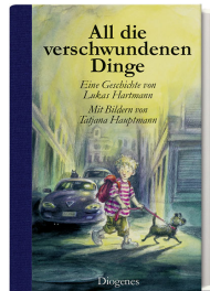
All the Missing Things 96 pages 2011