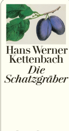
The Treasure-Hunters 544 pages 1998