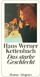
The Stronger Sex 448 pages 2009