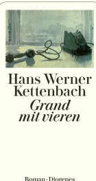
Grand With Four 240 pages 2000