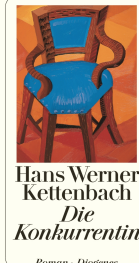
The Rival 528 pages 2002