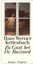
A Visit to Dr. Buzzard 368 pages 2006