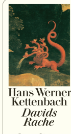
David's Revenge 304 pages 1994