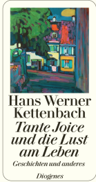
Aunt Joice and the Joy of Life 432 pages 2010