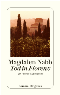
The Marshal and the Murderer 272 pages 1992