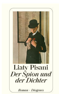
The Spy And the Poet 416 pages 1997