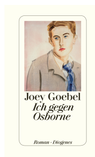
I Against Osbourne 432 pages 2013