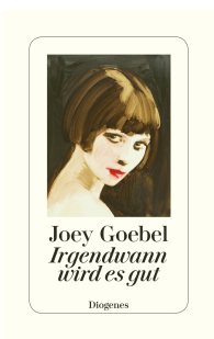
I Know It's Going to Happen for You Someday 320 pages 2019