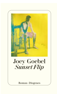
Sunset Flip 384 pages 2026