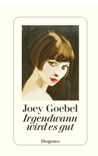
I Know It's Going to Happen for You Someday 320 pages 2019