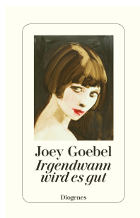
I Know It's Going to Happen for You Someday 320 pages 2019