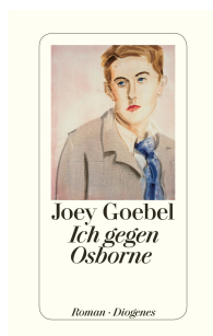
I Against Osbourne 432 pages 2013