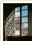
Magdalen Nabb Alta moda Guarnaccias elfter Fall Roman · Diogenes