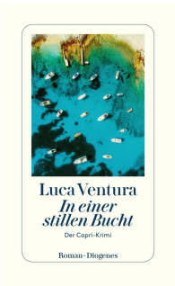
In a Hidden Cove 336 pages 2022