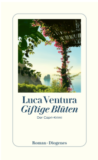
Poisonous Blossoms 368 pages 2026