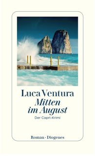
In the Middle of August 336 pages 2020