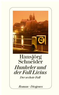
The Murder of Anton Livius 256 pages 2013