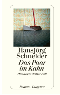
The Couple on the Barge 224 pages 2011