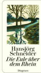
The Owl over the Rhine 288 pages 2021 🏆 Bestseller