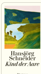
Child of the Aare 352 pages 2018 🏆 Bestseller