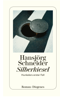
Silver Pebbles 240 pages 2011