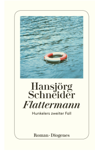
The Fluttering Man 160 pages 2011