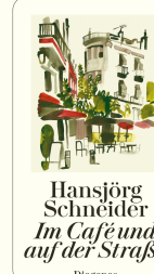
In the Café and on the Street 240 pages 2019