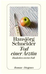
Death of a Doctor 240 pages 2011