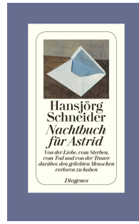
Night Book for Astrid 128 pages 2012