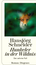
Hunkeler in the Wilderness 224 pages 2020 🏆 Bestseller