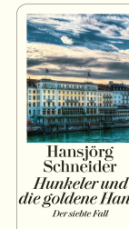
Hunkeler and the ›Golden Hand‹ 240 pages 2013