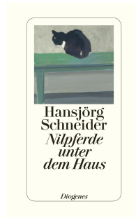
Hippos under the House 224 pages 2012